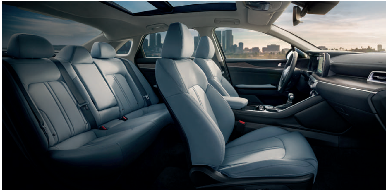
Panoramic Sunroof* (Available)