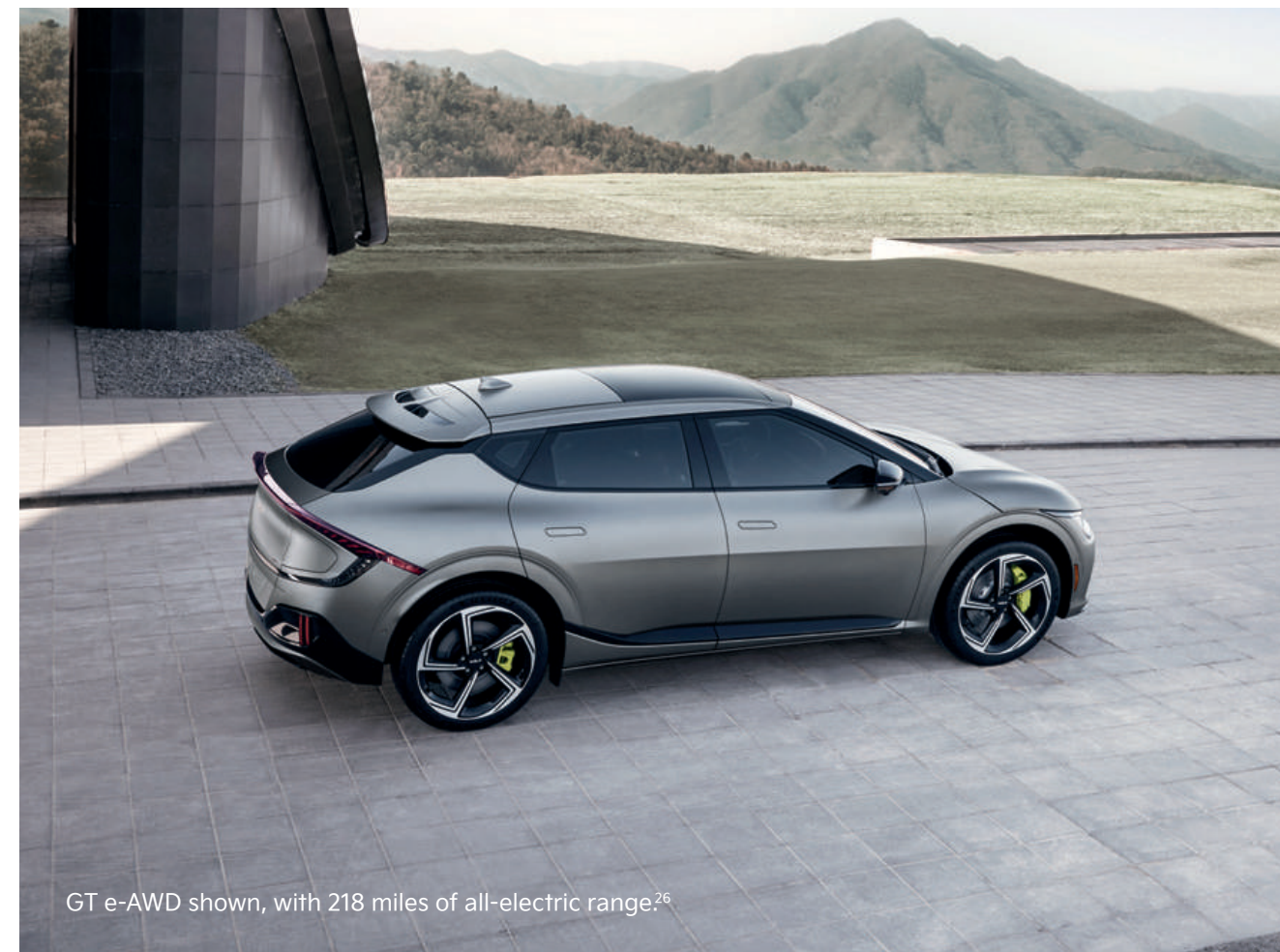
GT e-AWD shown, with 218 miles of all-electric range. 26

Built from the ground up on our revolutionary electric platform, the EV6 offers a choice of thrilling, all-electric drivetrains,* a 310-mile EPA-estimated range on a full charge, 26* and ultrafast DC charging capability. 12 Inventive and versatile, EV6 features a driver-oriented cockpit with 24.6-inch total combined Dual Panoramic HD display, 7 an available Augmented Reality Head-Up Display, 6* and CUV flexibility with AWD** capability — plus an available Onboard Power Generator 17* that functions as a portable power source for laptops to camping equipment. Want even more excitement? EV6's GT trim unleashes 576 horsepower,* and a blistering top speed of 161 MPH. 27*