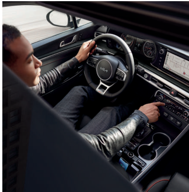
10.25-inch Touch Screen w/Nav 7* (GT-Line, EX, GT)