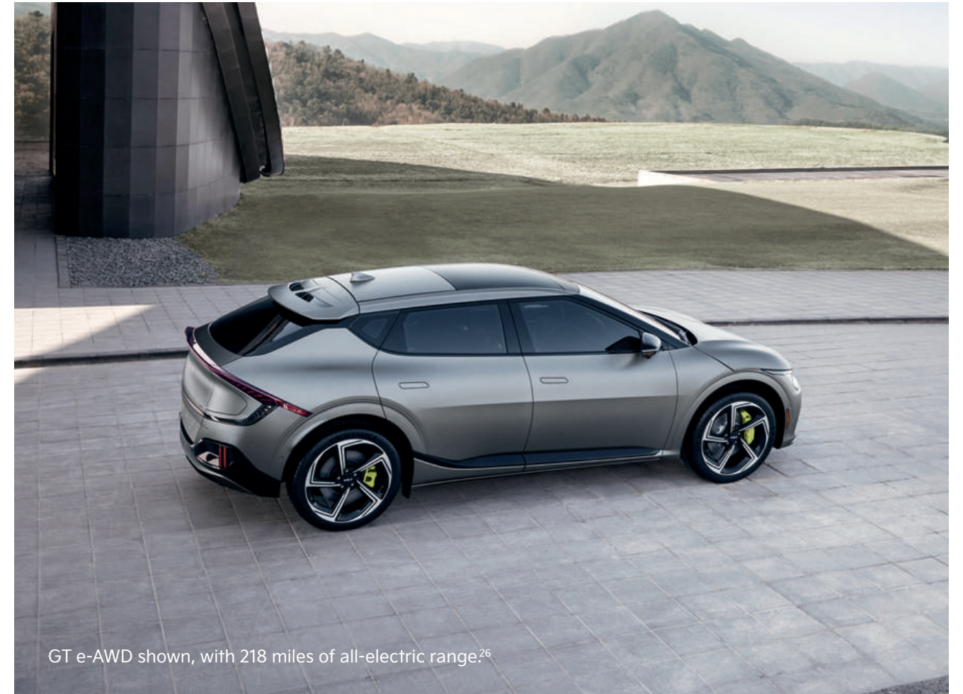
GT e-AWD shown, with 218 miles of all-electric range. 26

Built from the ground up on our revolutionary electric platform, the EV6 offers a choice of thrilling, all-electric drivetrains,* a 310-mile EPA-estimated range on a full charge, 26* and ultrafast DC charging capability. 12 Inventive and versatile, EV6 features a driver-oriented cockpit with 24.6-inch total combined Dual Panoramic HD display, 7 an available Augmented Reality Head-Up Display, 6* and CUV flexibility with AWD** capability — plus an available Onboard Power Generator 17* that functions as a portable power source for laptops to camping equipment. Want even more excitement? EV6's GT trim unleashes 576 horsepower,* and a blistering top speed of 161 MPH. 27*